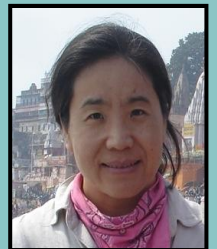
Equity in Post-Crisis China: A Feminist Political Economy Perspective Lanyan Chen