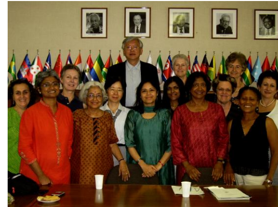
The Group in Geneva

In 2009, some of the authors met in Geneva to bring together the threads from each paper and weave it harmoniously into a synthesis document to be presented at the Beijing +15 session on the 54 th Session of Commission on the Status of Women in New York in 2010.