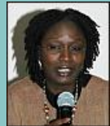
Paying the Price: The Cost of the Commoditization of Food and Water for Women Yassine Fall

The process, people and papers of the Casablanca Group are available at the website: www.casablanca-dream.net