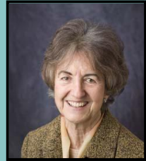
Globalisation, Labour, and Women's Work Lourdes Beneria