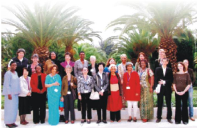
The Group in Rabat